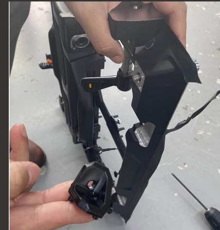
b. LED cube. One side cutting cabinet is only available to achieve the LED cube.