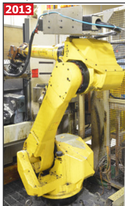
FANUC M-710iC 6-axis pick and place loading robot