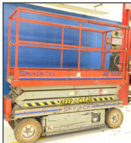
SKYJACK SJI3220 electric scissor lift