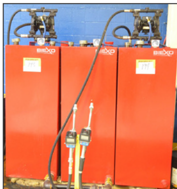
BIEXI oil storage tanks with digital metered dispensing guns