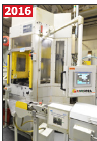
ACCU-CUT vertical honing machine