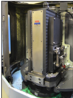
View of hydraulic clamping tombstones