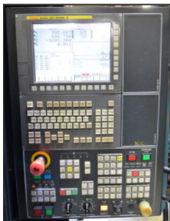
View of FANUC 321B CNC control