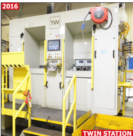
TRI-WAY OP10 4-axis CNC horizontal machining center