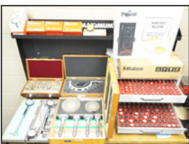
Partial view of QC inspection equipment available