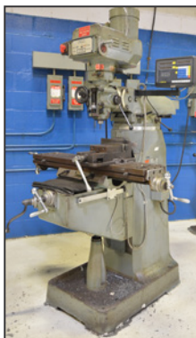
KBC S-2A vertical turret milling machine