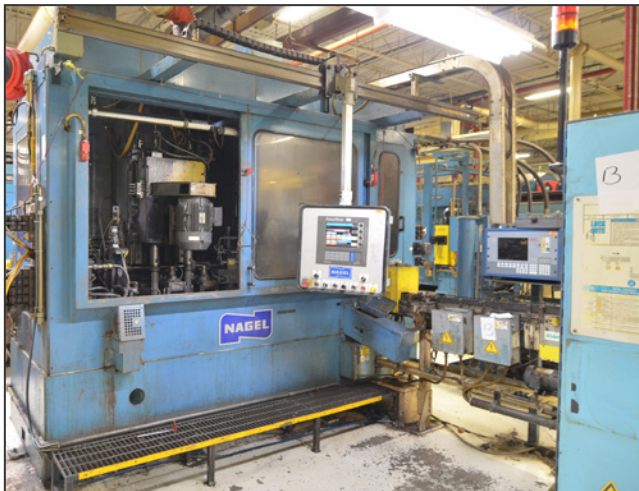
NAGEL OP80 CNC double spindle, vertical in-line precision honing machine

CONTACT 416.962.9600 TO CONSIGN EQUIPMENT AT AN UPCOMING AUCTION