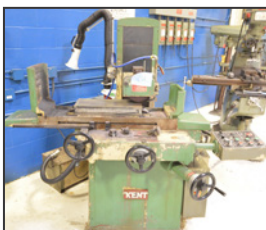
KENT KGS-250AH hydraulic surface grinder