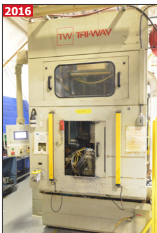
TRI-WAY OP20 hydraulic fracturing and assembly machine