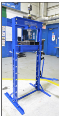
Late model shop press