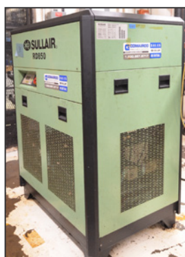
SULLAIR RD850 refrigerated air dryer