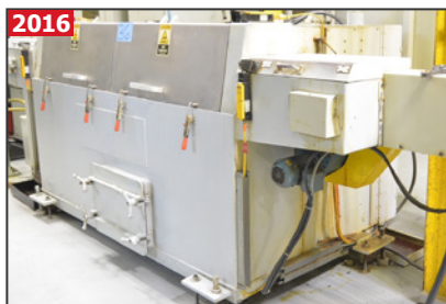
MDI-JD NORMAN OP70 high volume through type uplift hot parts washer