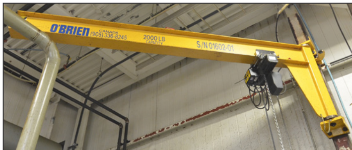
O'BRIEN 2000 lb jib crane