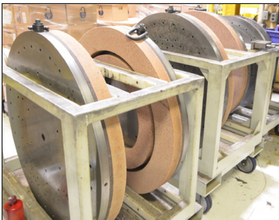
View of 42" grinding wheels