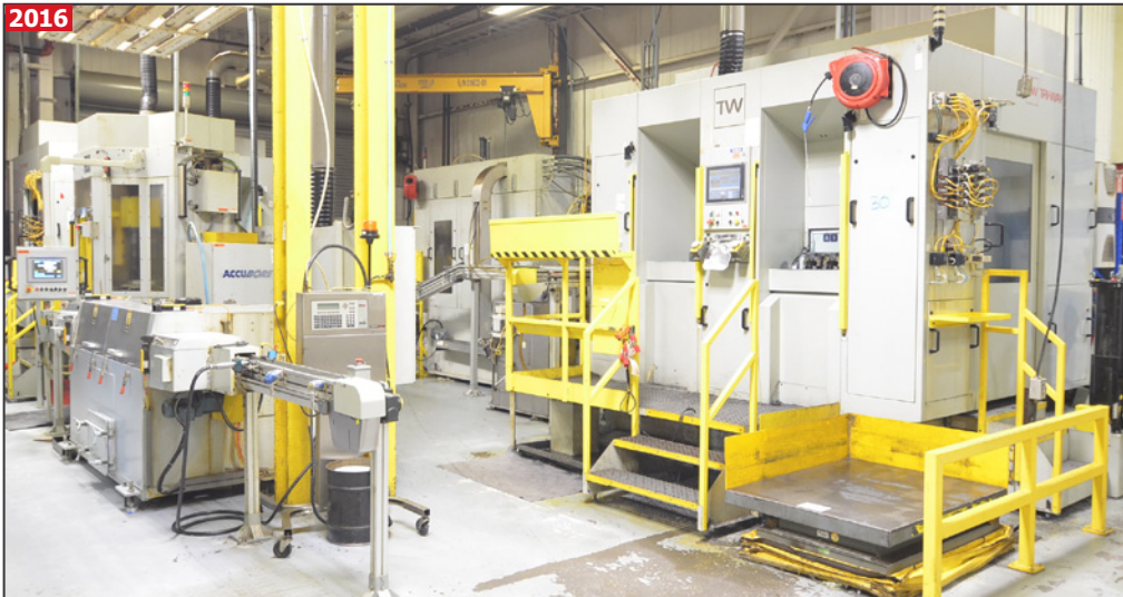
TRI-WAY LVL automotive flexible manufacturing line