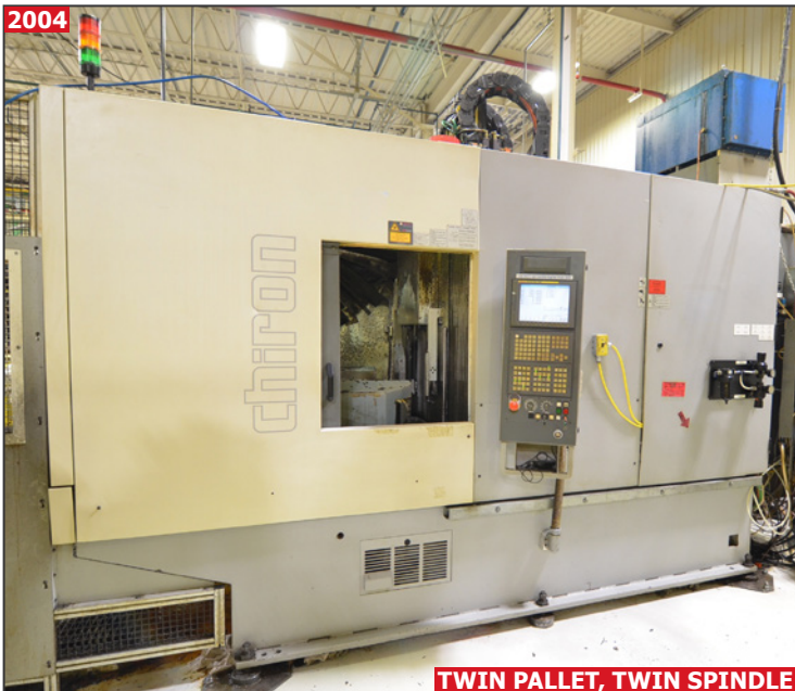
CHIRON DZ 15K W MAGNUM high speed 5-axis CNC machining center