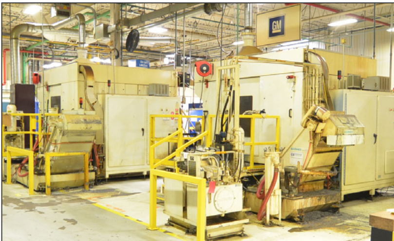
TRI-WAY FLEX automotive flexible manufacturing line