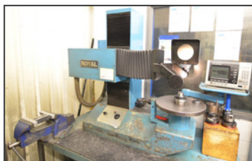
ROYAL digital tool presetter