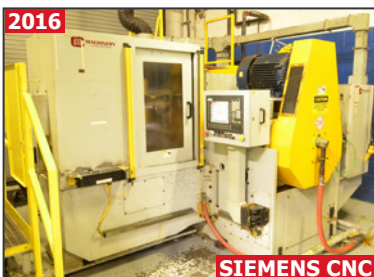
C&B SDG6-42 CNC horizontal double disk grinder