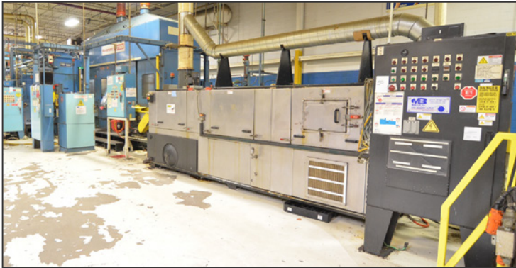
TRI-WAY L850 automotive flexible manufacturing line