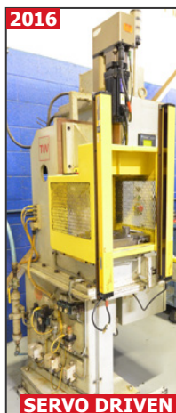
TRI-WAY OP30 hardware insertion press