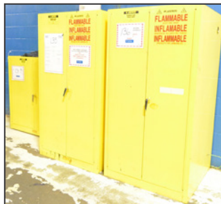
JUSTRITE safety cabinets