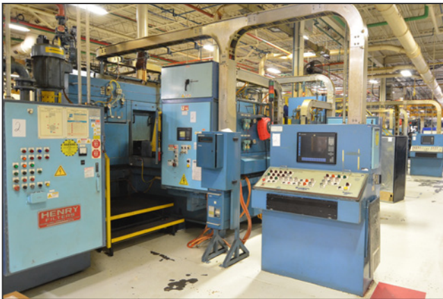
TRI-WAY FCA-CHRY automotive flexible manufacturing line