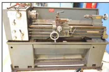
GRIP 1345 tool room lathe