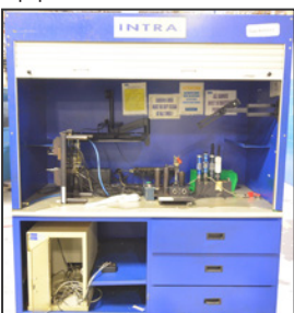
View of gauge bench

THIS BROCHURE IS ONLY A PARTIAL LISTING. PLEASE VISIT OUR WEBSITE