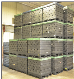
Large quantity of stacking bins available