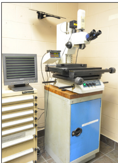
MITUTOYO MF 176-532A digital measuring microscope