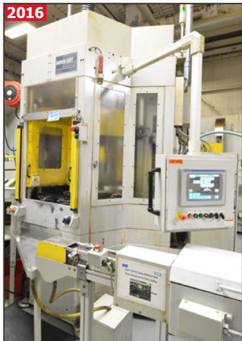
ACCU-CUT ACCUBORE 2X3SM-1 CNC (6) spindle precision vertical honing machine