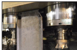
View of CHIRON 12,000 RPM twin spindles