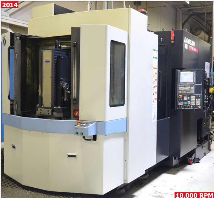
DOOSAN HC400 twin pallet CNC horizontal machining center