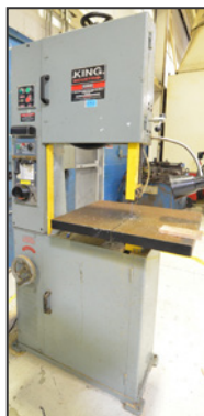
KING KC-450 metal cutting band saw